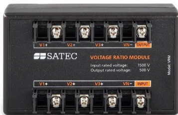
Figure 2: VRM Module