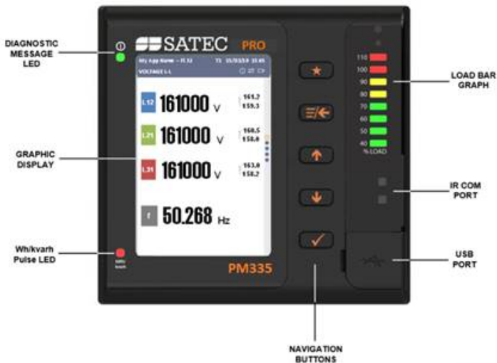
Figure 1: PM335 front panel

Warning! Only a licensed electrician may perform installations and wiring of the PM335.